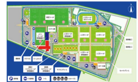
Creative Centre Osaka